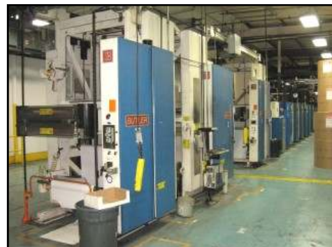
Hantscho M16 6 Unit 3 Web Coldset Press Line