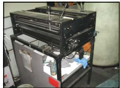
Manual Plate Bender

Call for Pricing & Additional Information PH: (262) 644-5877 EM: sales@discover-graphics.com