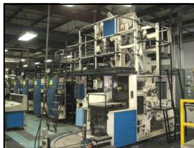
Cold-Set Press Line