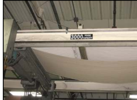
50" Roll 3000 LBS Hoist