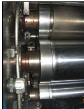
Bearers in Great Condition