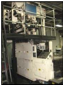
Hantscho 45A Quick Change Folder