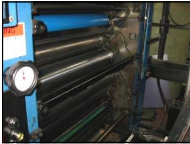
Extremely Clean & Well Maintained Units