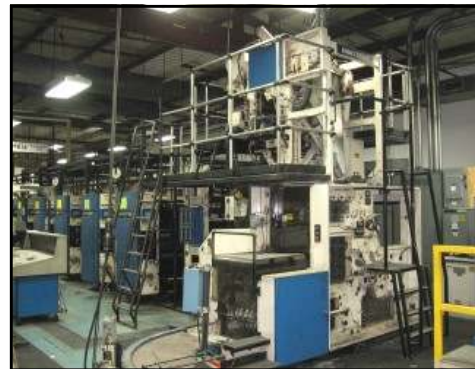
Hantscho 45A Combination Folder with Pushbutton Changeover (Mag, DP & Tab Folds)

Call for Pricing & Additional Information