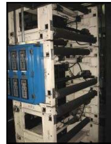
Hantscho M16 6 Unit 3 Web Coldset Press