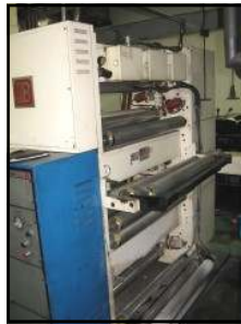
Butler 3-Web Infeed