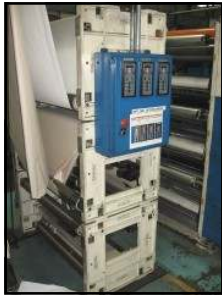
WPC MicroTrak 9400 Web Guides