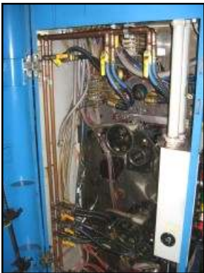
Well Maintained & Extremely Clean